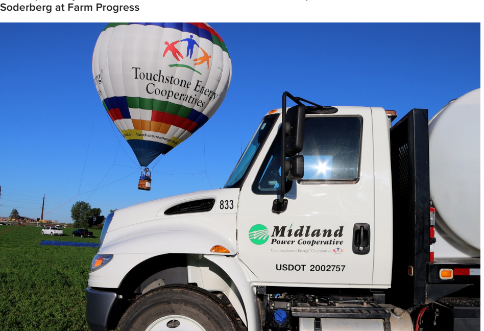
The Touchstone Energy hot air balloon was on hand to welcome attendees each morning